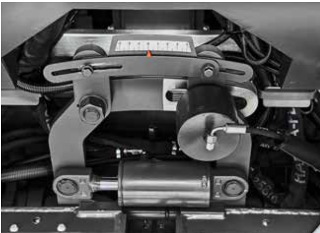
Hydraulic crown control