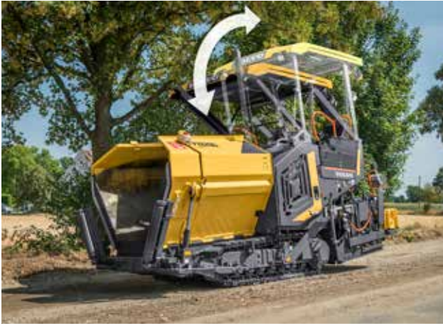
Electro-hydraulically foldable roof