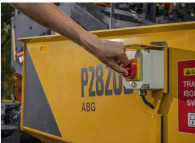
Lateral emergency switch